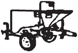
Small Line Pump